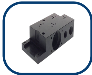
Delrin 3 Axis Machined