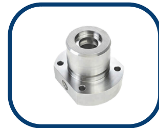
316 Stainless Steel Turning/Lathe