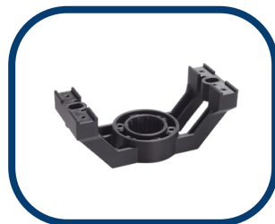
ABS FDM Printed