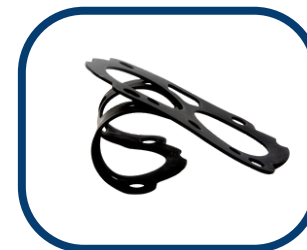
PP Resin SLA Printed