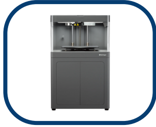
Fused Deposition Modeling