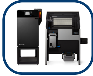
Selective Laser Sintering